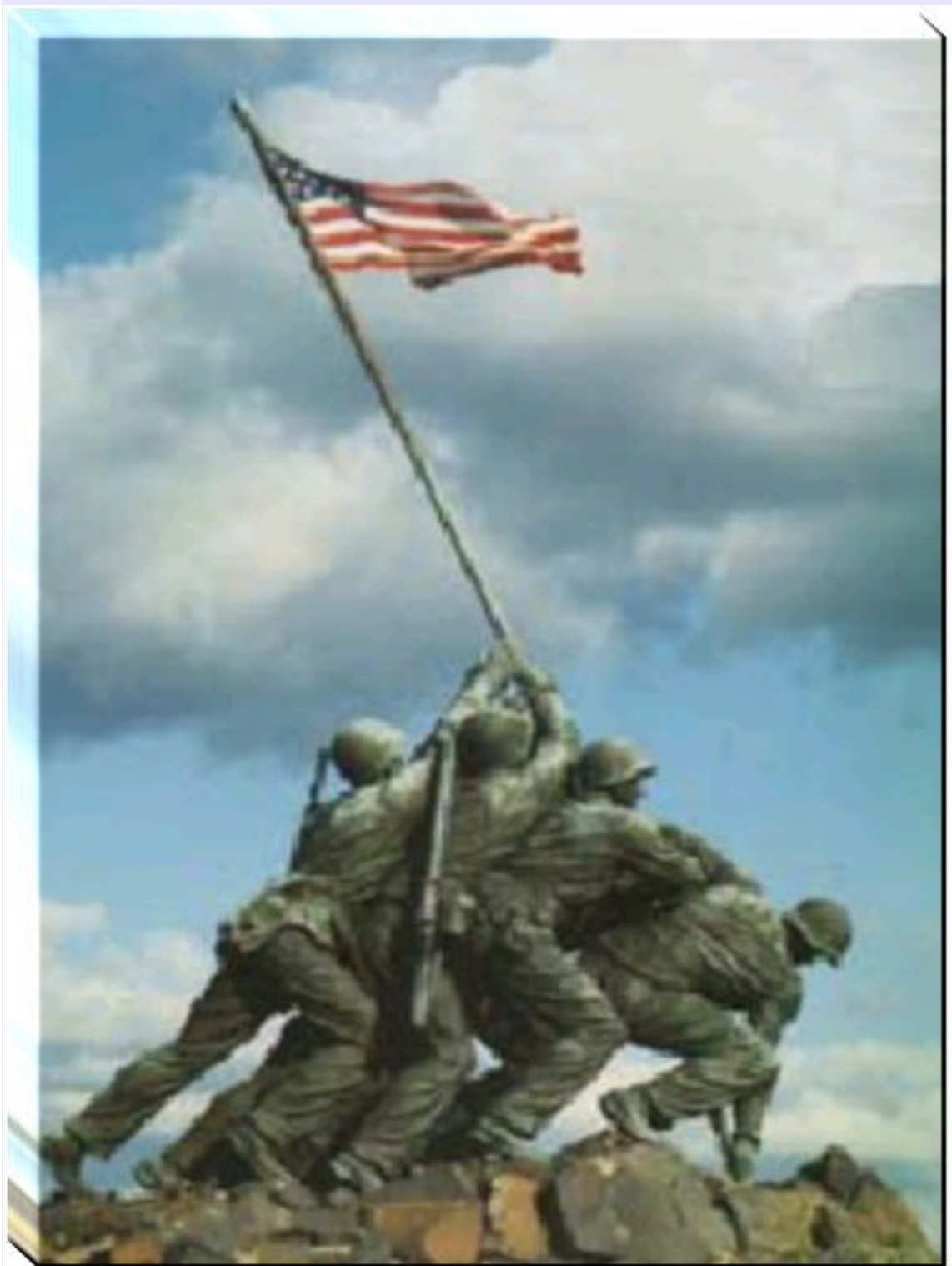
The American Flag OUR FLAG